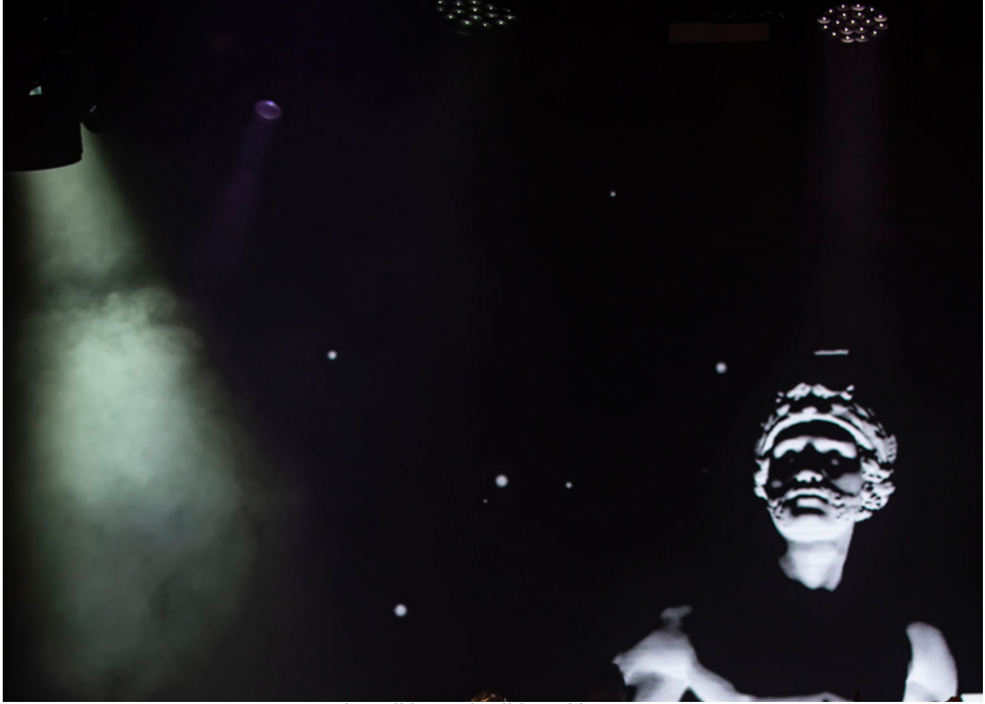
Robe Spikles and Spilders Shine through the Myst