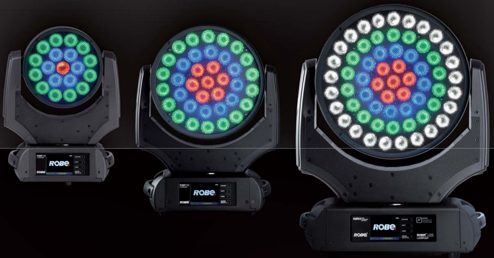
ROBIN® 300 LEDWash

The LEDWash series offers three conveniently sized options to suit all applications - from live events to installations. We hope you appreciate will the pop-up art design of the brochure and find it as imaginative and fun as actually using the LEDWash series!