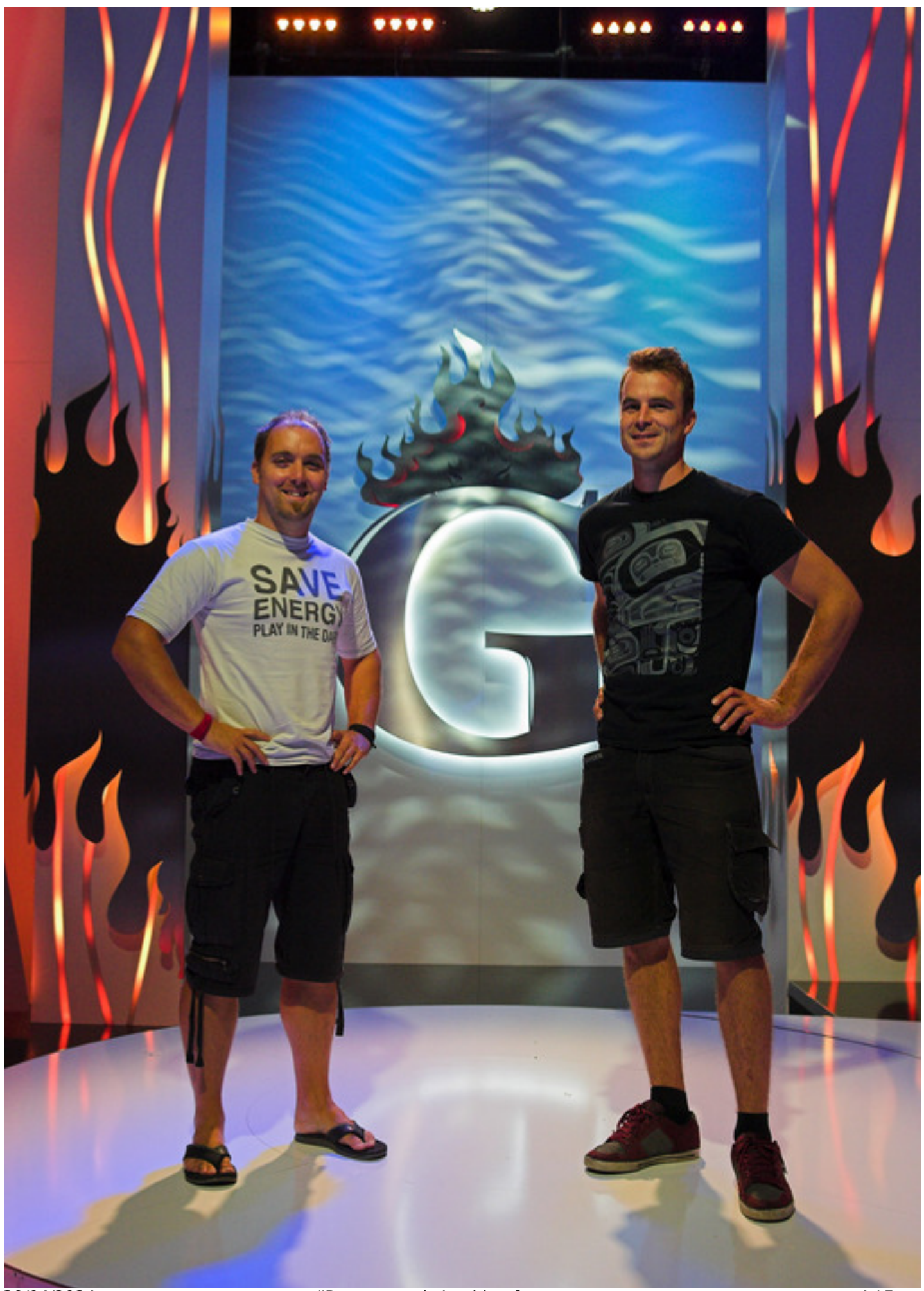
30/04/2024 "Restaurant is Looking for a