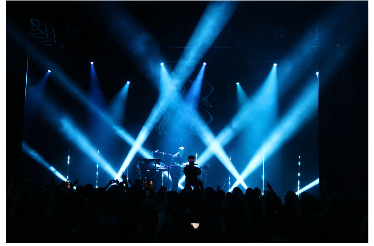
Chasing the Dragonfly with Spikies