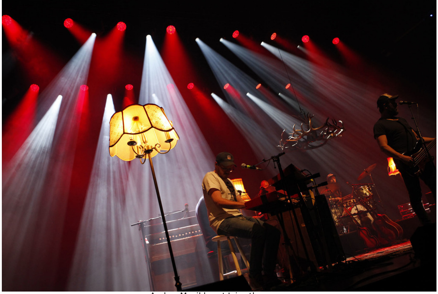
Aarhus Musikhuset Joins the Spiiders Web