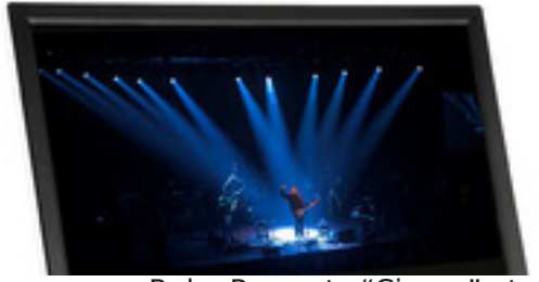
Robe Presents "Cirque" at Prolight+Sound 2018