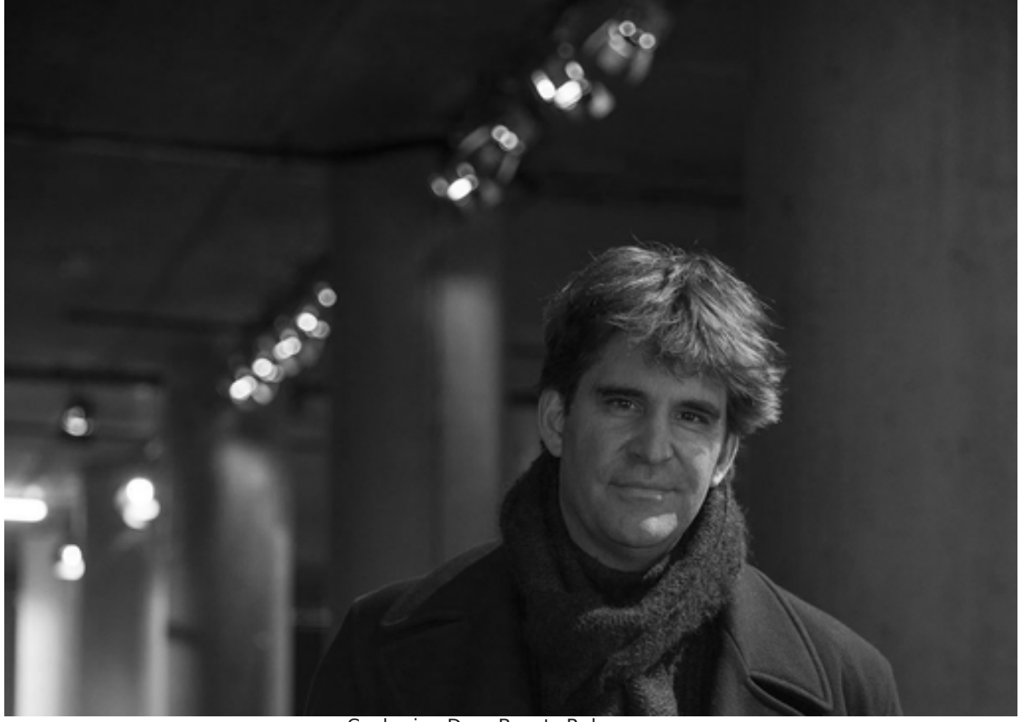
Cankarjev Dom Boosts Robe stock