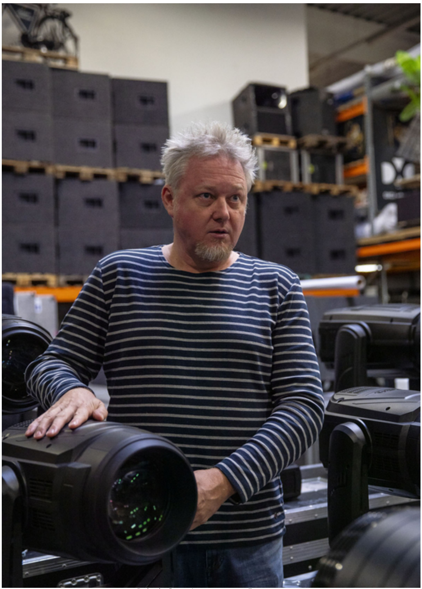
Robe is Great Investment at For Event