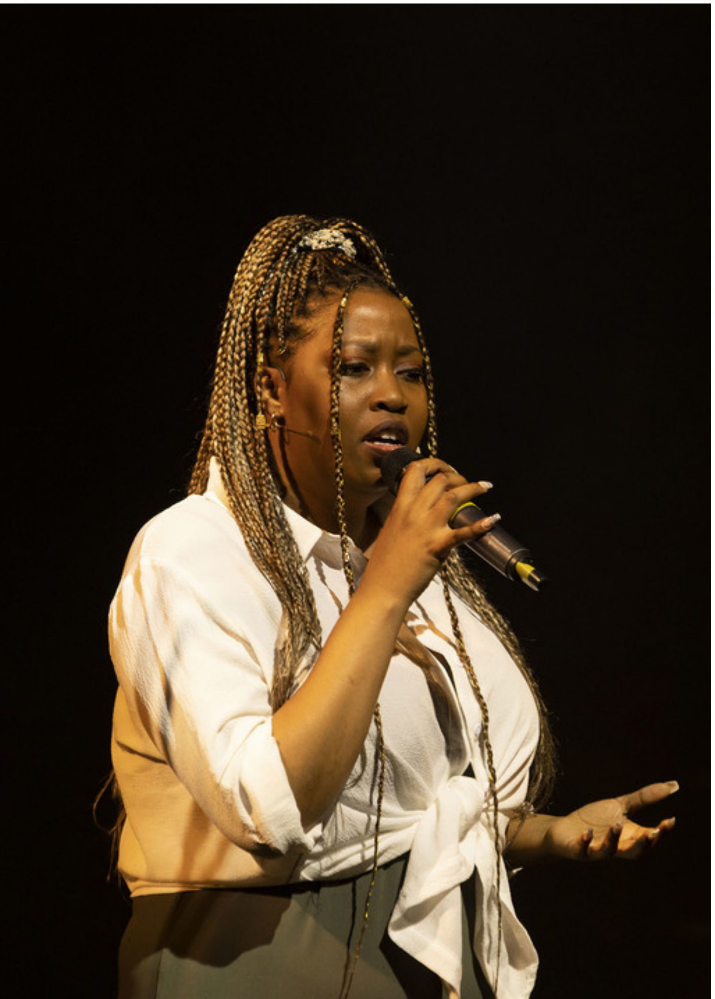
Robe T1s Get Musical at Curve Theatre