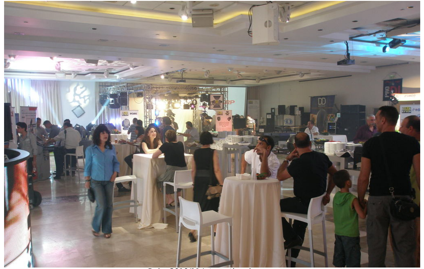
Robe 2010/11 International Roadshow kicks off in Israel