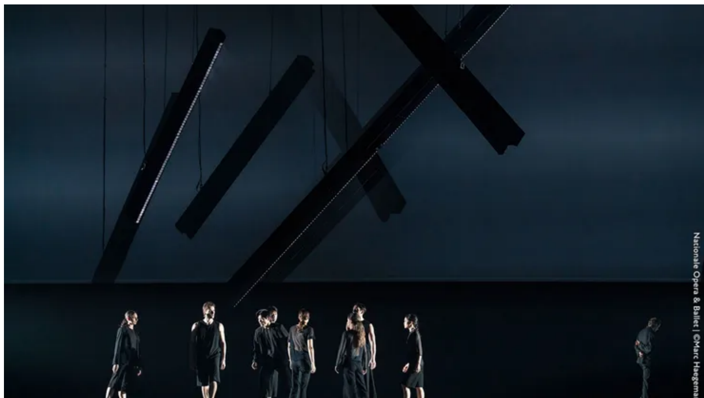
Nationale Opera &amp; Ballet | ©Marc Haegeman